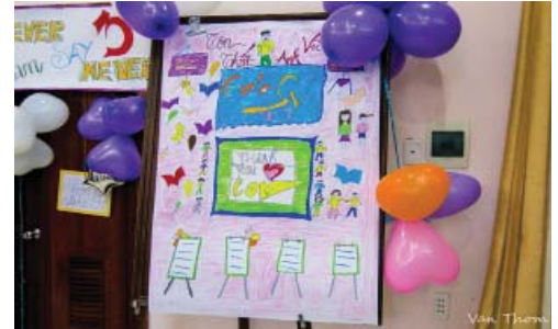
Poster thanking HSBC and COV

Also, every year the students raise funds and then decided where to donate these funds. In past years, they have purchased food and distributed this food to poor families at the hospital, and another time they purchased supplies for an orphanage then joined the young children for fun and games.