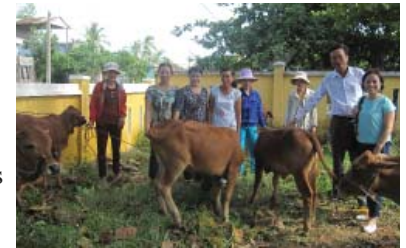
Breeding cows can offer these women a substantial way to feed their families

With RAH serving as technical lead, this new enhancement is a key addition to COV's existing comprehensive EFWC. Through EFWC, these women and their children have already or will soon receive health and nutritional support (you cannot work if you are ill), house repairs if needed, and school scholarships for their children. EtE aims to further alleviate poverty for women entrepreneurs by fostering business skills and networking, providing microfinance, and equipping their businesses with basic services.