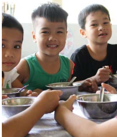
Boys enjoying a nutritious meal