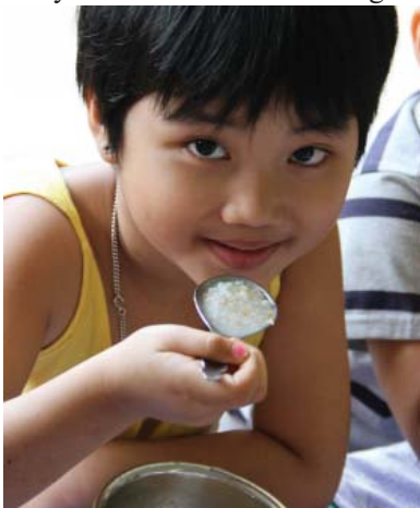
Filling her tummy

“About 2.1 million or 24.9 per cent of the Vietnamese children under the age of five suffer from malnutrition, according to statistics from the National Nutrition Institute. In addition, 1.2 million or 14.5 per cent of the country’s children are underweight. That means one in every four Vietnamese children under the age of five suffers from malnutrition, while one in every six children is underweight.” -- Vietnam News, August 6, 2015