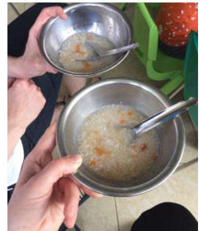
Porridge with 23 vitamins and minerals.