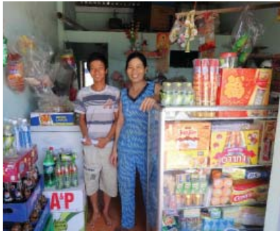
A small business opens up a great amount of hope for this family

We are delighted to announce a new initiative with our partner Rise Against Hunger (RAH) that will enhance and advance our Empowering Foundations for Women & Their Children (EFWC) program which helps single moms provide a better quality of life for their children. Thanks to a grant and technical advice from RAH, over 200 women will improve their business acumen and financial literacy, boosting them and their children to economic