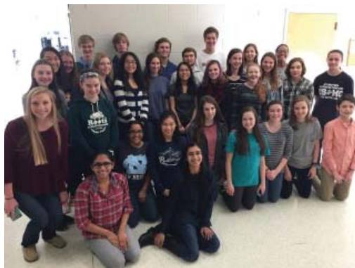
Reagan High School Key Club