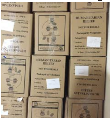
Rise Against Hunger food shipment