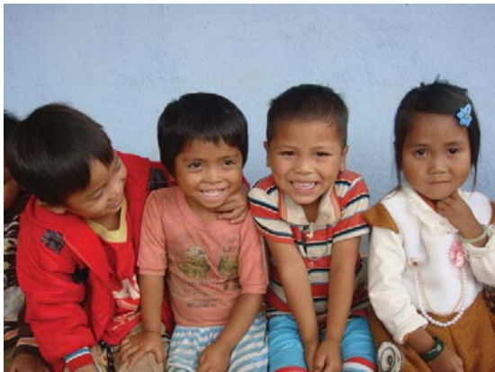
These children cannot wait

Members of the C'tu make up 97% of the population, and nearly all live below the poverty level. These generous and peaceful people primarily live off the land. The rainy weather is ideal for growing jute to produce fibers needed for their beautiful textiles. Many have neither sanitation facilities nor clean drinking