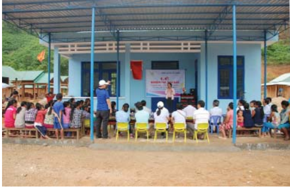
New kindergarten dedication ceremony

Ethnic minority groups make up around 12m of Vietnam's population of 90m, but account for over 50% of the poor. Mountainous areas in the central region,