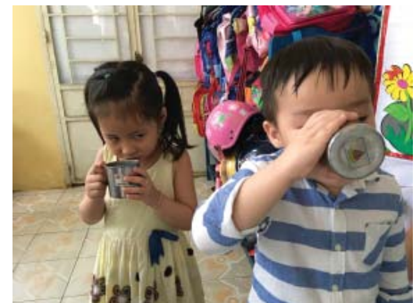
Girl in Yellow swallowing parasite treatment