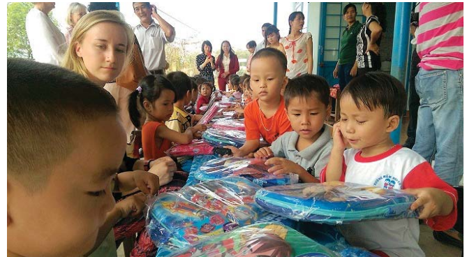
Backpack gifts for the young children at Binh Dinh Nam Kindergarten