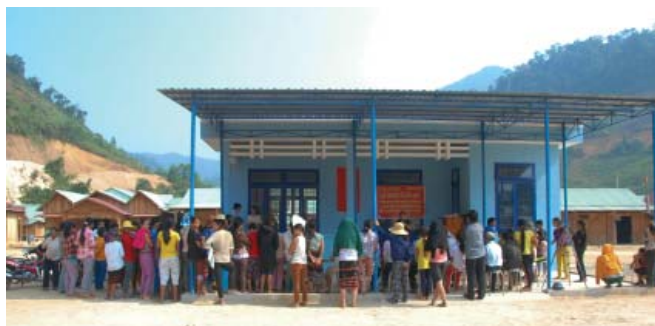
Ethnic minority village gathering to celebrate a new kindergarten