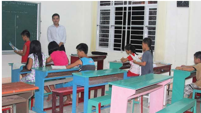
Tutoring program helps Hoa Mai Orphanage children succeed in school