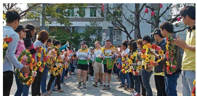
COV Cycling Team welcomed as they cross the finish line