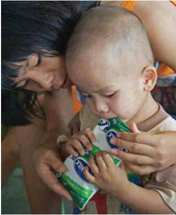
Young boy being helped by older child to drink milk from special packaging to ensure freshness