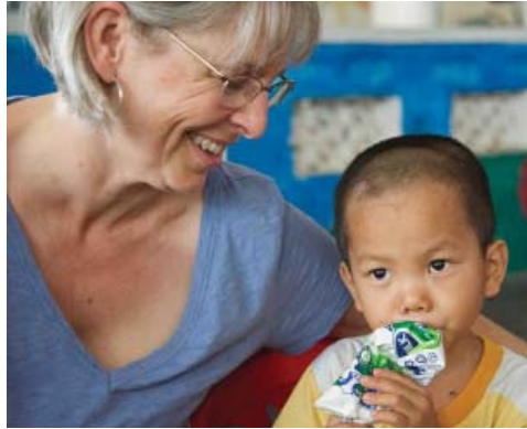
COV Executive Director with boy during a visit at Tam Ky Orphanage