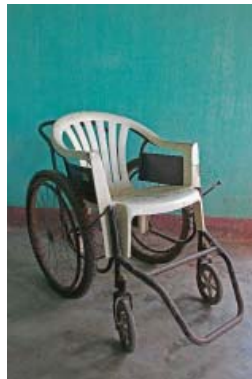
Wheelchair no longer needed . . . a true triumph!