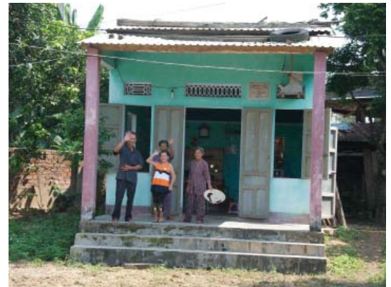
The family still lives in the house we built 7 years ago