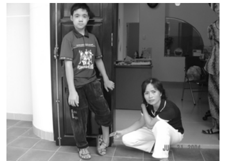
Child who will get an orthopedic operation to correct a club foot