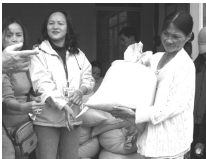
COV supplemental rice distribution program assists over 145 families a month..